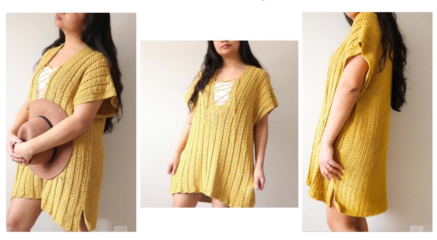
@knitsandknotsbyame and @lionbranyarn See more from KKAME Designs at www.knitsandknotsbyame.com